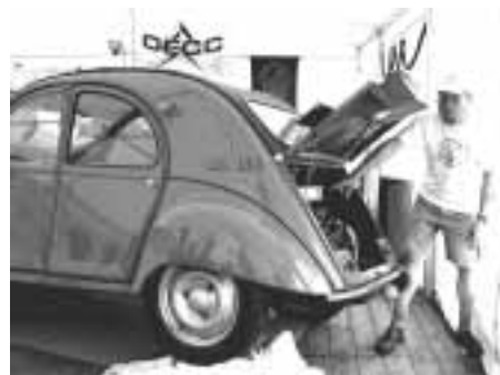
Peter and his 2CV Sahara just beside the festival tent

Two of the best Saharas are right now in the museum tent just beside the festival tent, flanked from an edited version of our 30 year club history (stickers, T-shirts, cups). Even a replicated Sahara (2 x 36 PSI), a wonderful 58 2CV (exposed lying springs you can look at without making a belly flop) and a 2CV which was found in barn, in the honest condition 5 (but with a chicken, a marten and a lot of rust). Real sportsmen will also love the twin-engine foreign brand production.